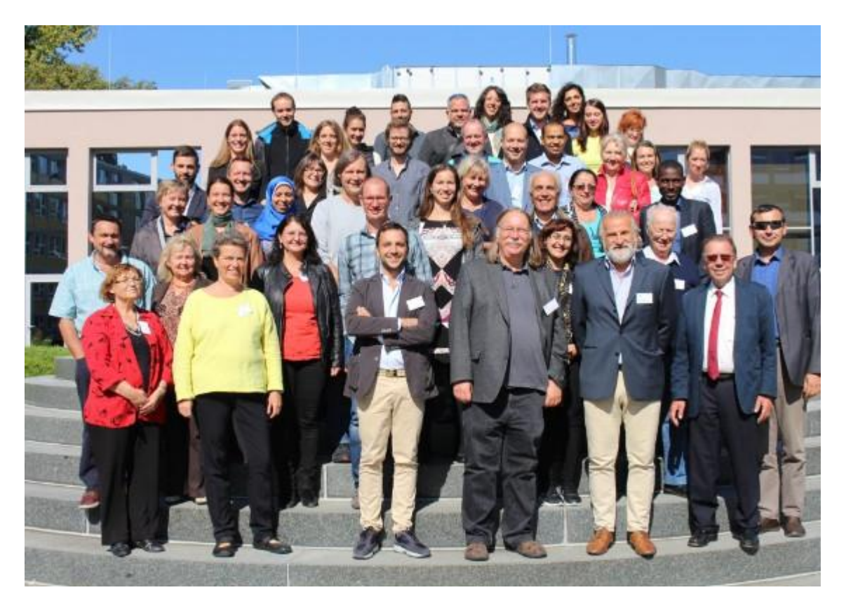
General Meeting Czech University of Agriculture Prague 2016

An international consortium of scientists, led by the University of Hohenheim, Germany, has launched a large, EU-funded, integrated project for the development of alternative fertilization strategies by the use of so-called "bio-effectors". "Resource Preservation by Application of BIOefFECTORs in European Crop Production" (BIOFECTOR) is a unique project in European Union's 7th Framework Programme, bringing together top scientists from academic institutions and small and medium Enterprises with a wide range of topic Expertise.